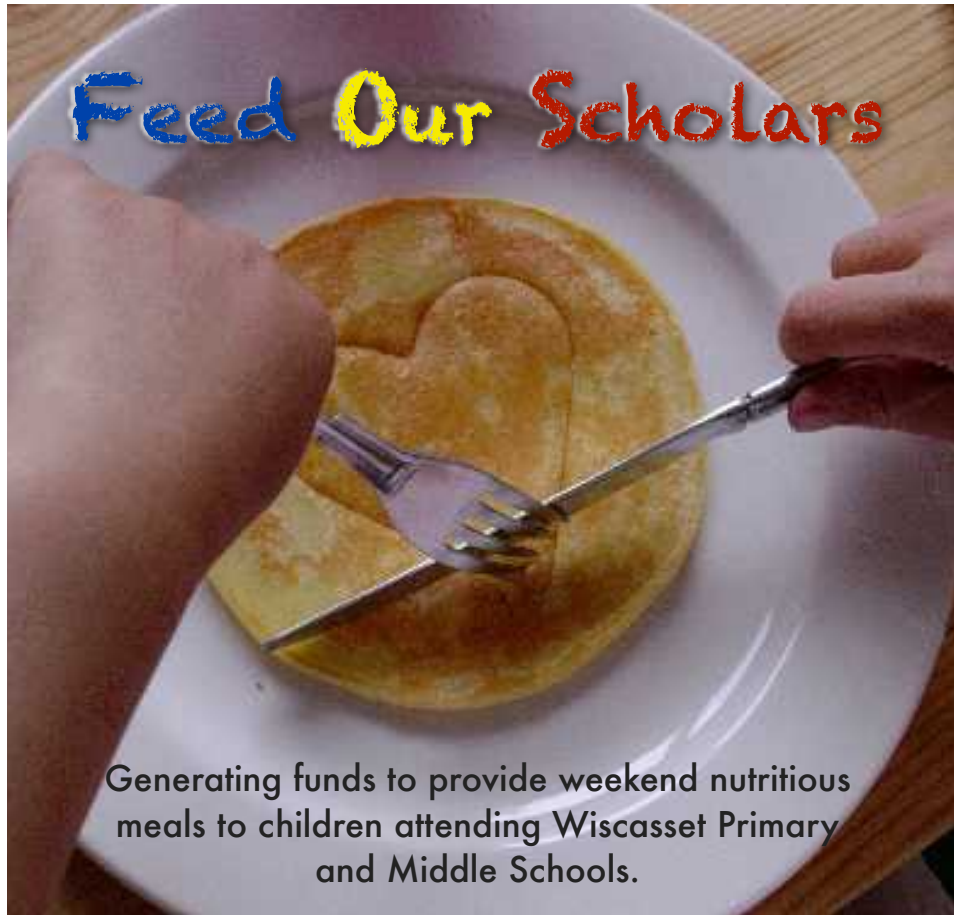
Generating funds to provide weekend nutritious meals to children attending Wiscasset Primary and Middle Schools.