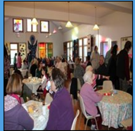
April 6th, 2013 - Our first fundraiser: a Spaghetti Supper/Silent Auction. Nearly 100 people attended this event. Local businesses donated 85 auction items. $3000 was raised.

Good Shepherd Food Bank through a generous grant from Merrill Lynch, provided a Kids' Pantry at Wiscasset High School, one of eight selected to pilot the program in Maine. As well as a cupboard of shelf-stable foods housed in the school that is accessed