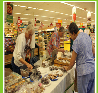
A summer Bake Sale at Shaw's in Wiscasset.