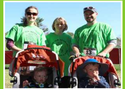
May 4th, 2013 Feed Our Scholars hosted a 5k Family Fun Run/Walk.

Thank you to CopyShop in Wiscasset for your support!