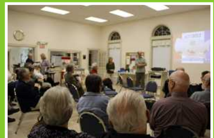
A September screening of A Place At The Table.